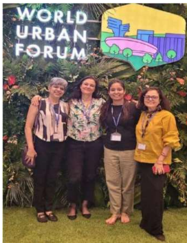
Safetipin team with Fondation Botnar

Training event: We conducted training on our methodology and data collection tools with Lima Cómo Vamos Ocupa Tu Calle, Intendencia de Montevideo, UN-Habitat, and Her City. The interactive session aimed to develop practical skills to encourage the use and development of