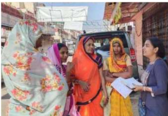
YAARA Advocates conducting user surveys in a community

Youth Advocates, along with other young people in their communities, conducted safety audits on My Safetipin App. Using Safetipin Nite app, images were collected over 1,078 km and 400 km of road length in Jaipur and Udaipur respectively. Civic infrastructure, built environment and space usage by people were assessed to generate over 11,500 and 5,000 safety audits in Jaipur and Udaipur. Students of School of Planning and Architecture (SPA), New Delhi also supported the activity by collecting spatial data and mapping public spaces and