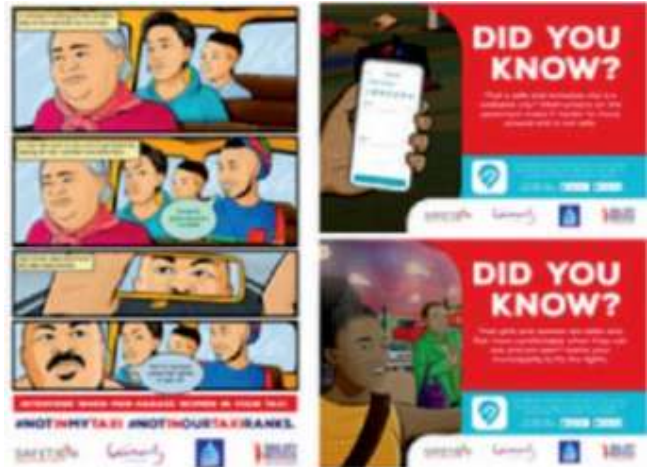
Social Media Campaign to encourage citizens to conduct safety audits in Durban

As part of our outreach plan, a social media campaign was also launched in which we transformed women's experiences, as documented during data collection and community engagement processes, into compelling visual narratives. By leveraging popular mass media and social media we aimed at creating an enabling environment for individual and collective approaches to realizing constitutionally guaranteed rights.