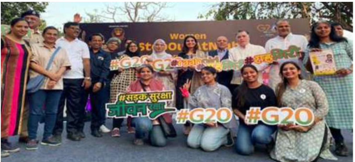
#StepOutAtNight at Chandni Chowk