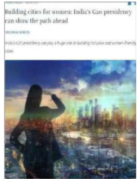
Observer Research Foundation (ORF) February 2022