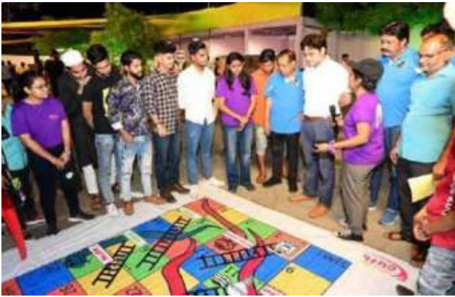
MAJMA event organised and supported by Jaipur Smart City

Over 15 CSOs from Jaipur joined the workshop and committed to working towards creating youth and gender-responsive city infrastructure and services. In partnership with the Share a Smile Foundation, the CFY team has been organising activities (user surveys, safety audits, sports/games, film screening, art classes, plantations etc.) to engage communities.