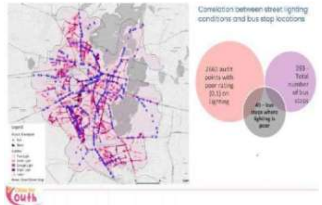
Map showing lighting condition at the bus stops of Jaipur

They found engaging with youth to identify problems of cities through data and design, a novel approach. Opportunities for domain integration and strong engagement with the government were key value additions for CSOs to engage with CFY. We collaborated with Azad Foundation (an NGO focusing on skill development for livelihood generation) to conduct user perspective surveys for a pilot street intervention project with the State Department of Transportation and Road Safety.