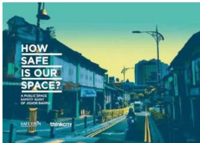
Johor Bahru safety audit report

Johor Bahru- In partnership with Think City, an urban think tank based in Malaysia, Safetipin began a pilot project involving safety audits within the Greater Johor Bahru region. This study, which commenced in October 2020, undertook a comprehensive evaluation of both the city's physical infrastructure and its social environment using two apps—Safetipin Nite and Safetipin Site. The initiative resulted in the generation of 974 safety audits, accompanied by the collection of approximately 9000 images. Safetipin Site also facilitated the evaluation of supplementary parameters such as Vegetation, Emergency Services, Accessibility, Noise, and Cultural Balance. The data was used to establish a baseline, identify hotspots, and design targeted