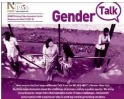
NCAER National Data Innovation Center Measurement Brief, February 2023