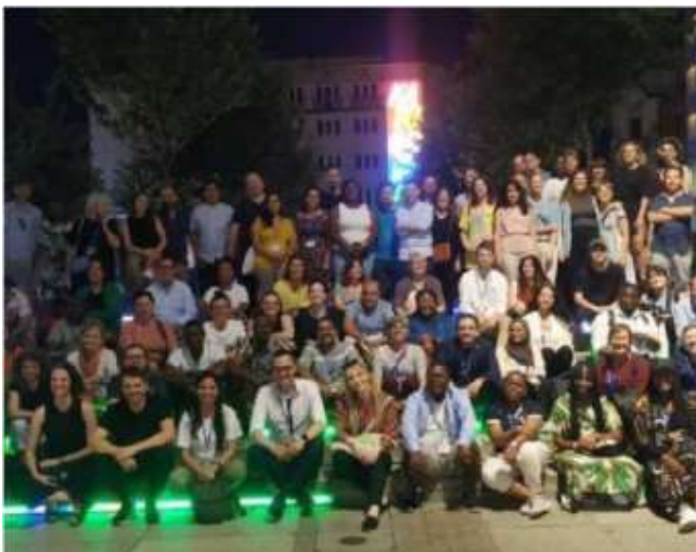
Night safety audit walk at Katowice, Poland

Nighttime Safety Audit Walk: On June 25th, prior to the opening of the WUF 11 in Katowice, Poland, Safetipin led a safety audit walk in partnership with UN Habitat, European Forum for Urban Security (Efus), Vibe Lab and the City of Katowice. More than 200 people participated in the walk which was led by the City Secretary of Katowice. All the participants were shown how to use the My Safetipin app and more than 100 audits were done that night. The walk culminated at the city centre where the participants were invited to see the control centre of the city administration.