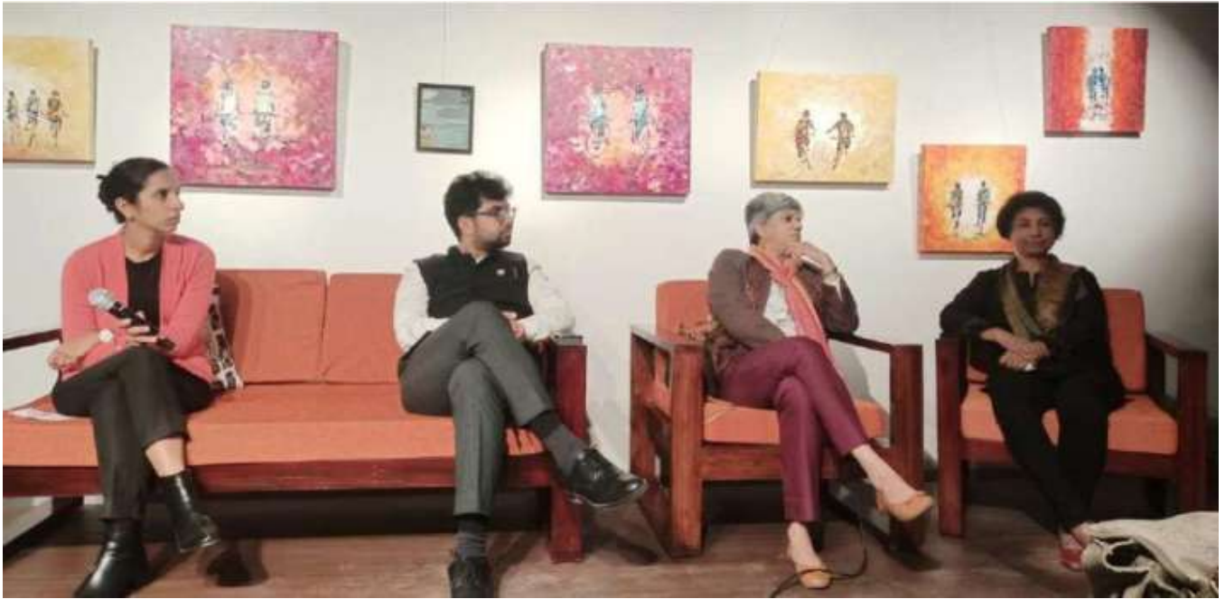
Sustainable Mobility Network