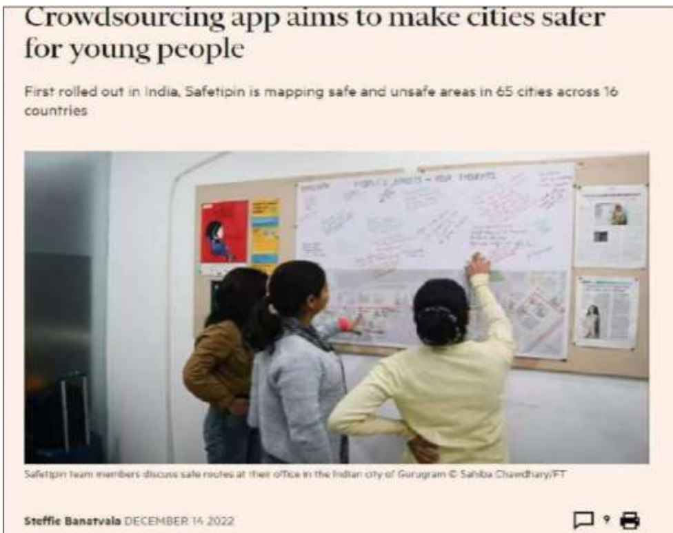
Financial Times, December 2022