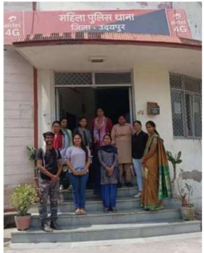
YAARA advocates interact with Udaipur city police

community areas in both the cities. YAARA advocates also shared their understanding of the social and cultural aspects of their own communities with SPA students.