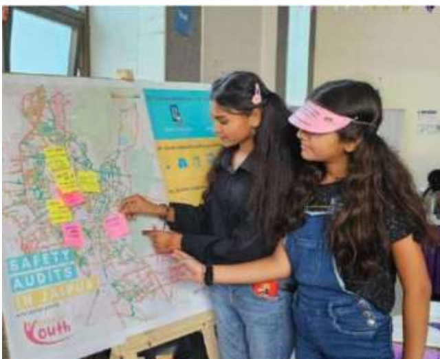
Young people marking safe/unsafe locations in Jaipur

Cities for You(th) project seeks to address the issue of building safe and inclusive urban spaces for young people. Launched under the 'Fit4Future' program of Fondation Botnar, it is being led by Safetipin in collaboration with several partner organisations in four cities of Rajasthan. In Jaipur and Udaipur, The YP Foundation and Saarth have partnered to develop and implement a youth leadership program titled Youth Advocacy for Accountability on Rights and Action (YAARA). The students of the School of Planning and Architecture, Delhi have conducted spatial mapping research and produced conceptual design interventions in the two cities. StartUp is the monitoring and evaluation partner for the project.