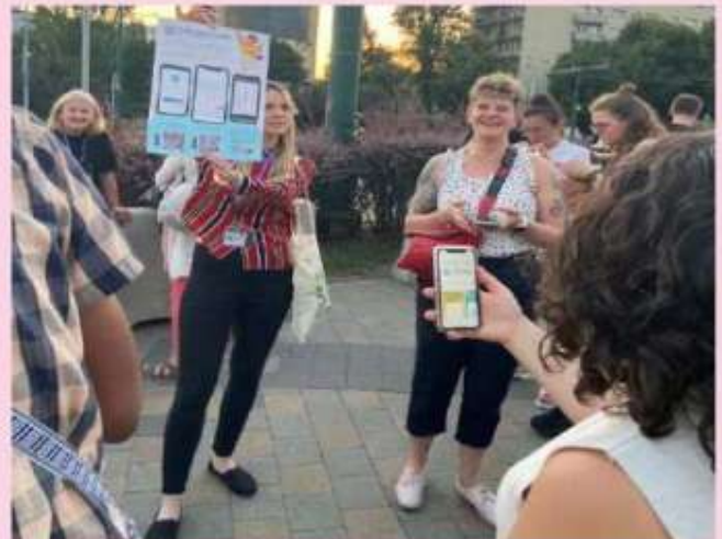
Safetipin poster being shown before safety walk in Poland