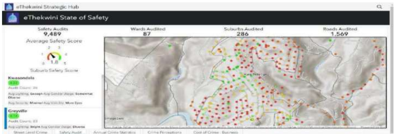
Safetipin Data integrated in eThekweni State of Safety Dashboard