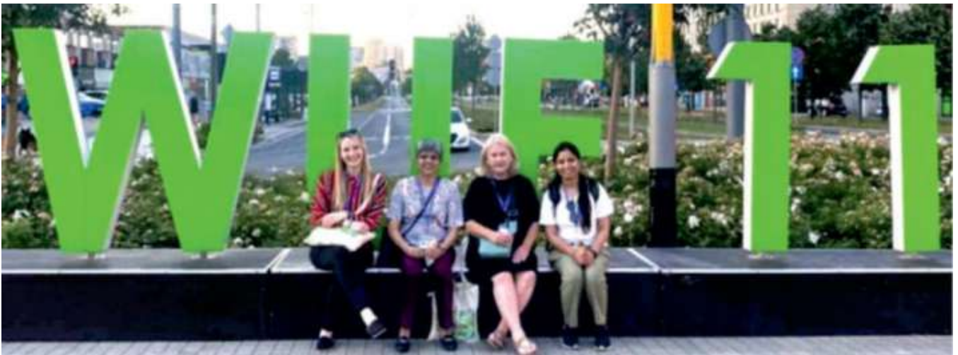
Safetipin team at WUF 11

sustainable urbanisation, which resonates with Safetipin's mission. Using data insights from multiple projects we were able to add to the collective knowledge pool and emphasise the need for gender-inclusive urban planning for creating sustainable urban spaces, especially in developing countries.