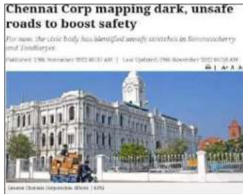
The New Indian Express, Nov 2022