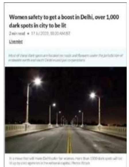
Mint, August 2022