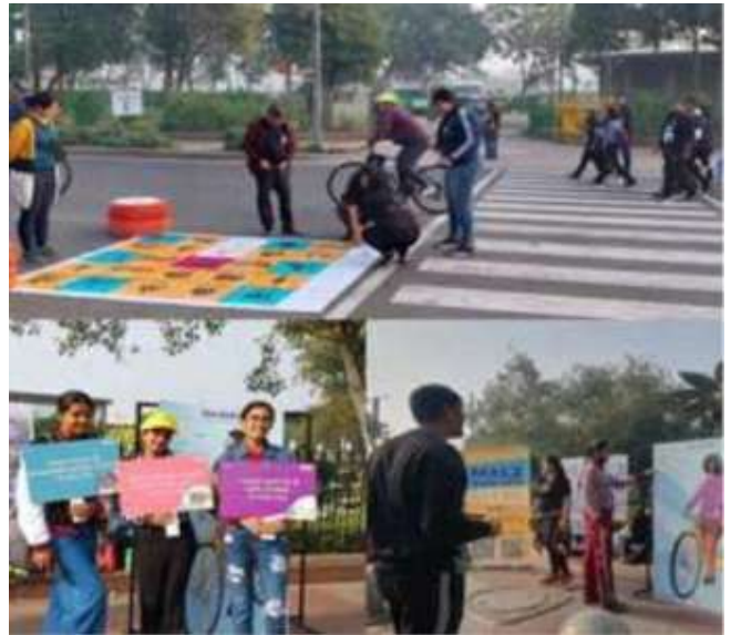
Raahgiri event at Connaught Place, Delhi

#StepOutAtNight: In the month-long celebration to mark International Women's Day, Safetipin and Raahgiri Foundation supported the Municipal Corporation of Delhi in a public space activation event named #StepOutAtNight. It was held near Hardayal Library in Chandni Chowk on March 25th, 2023. Various social impact organisations including Jagori, The YP Foundation,