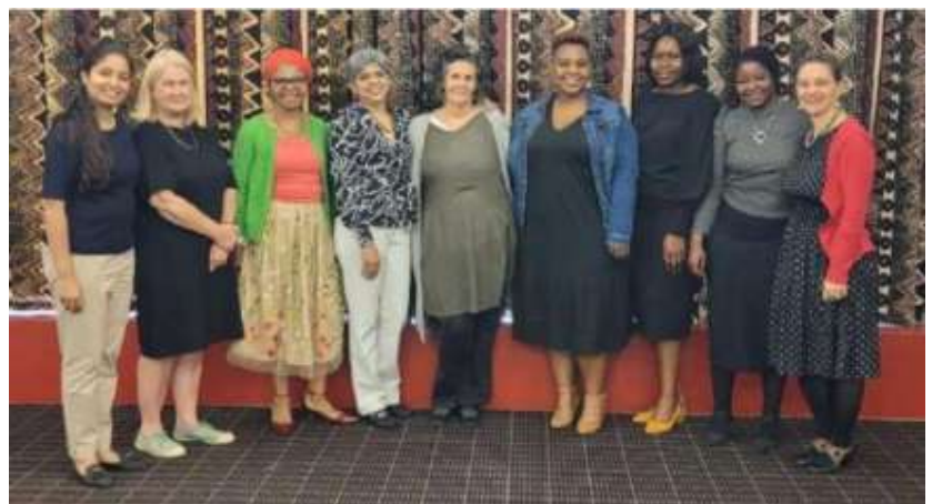
Project Team: Safetipin, Soul City Institute, Fixed Africa, eThekweni Municipality and The Womanity Foundation