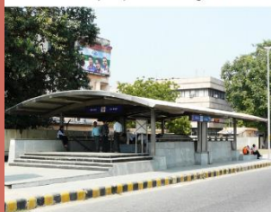
ENHANCING LAST MILE CONNECTIVITY a safety analysis of the Jor Bagh Metro Station