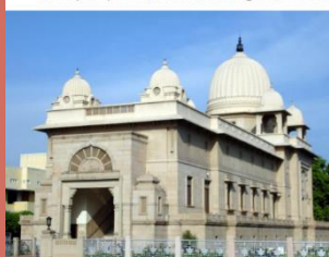
ENHANCING LAST MILE CONNECTIVITY a safety analysis of the RK Ashram Marg Metro Station