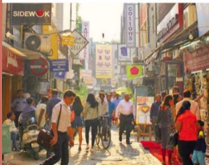
ENHANCING LAST MILE CONNECTIVITY a safety analysis of the Khan Market Metro Station